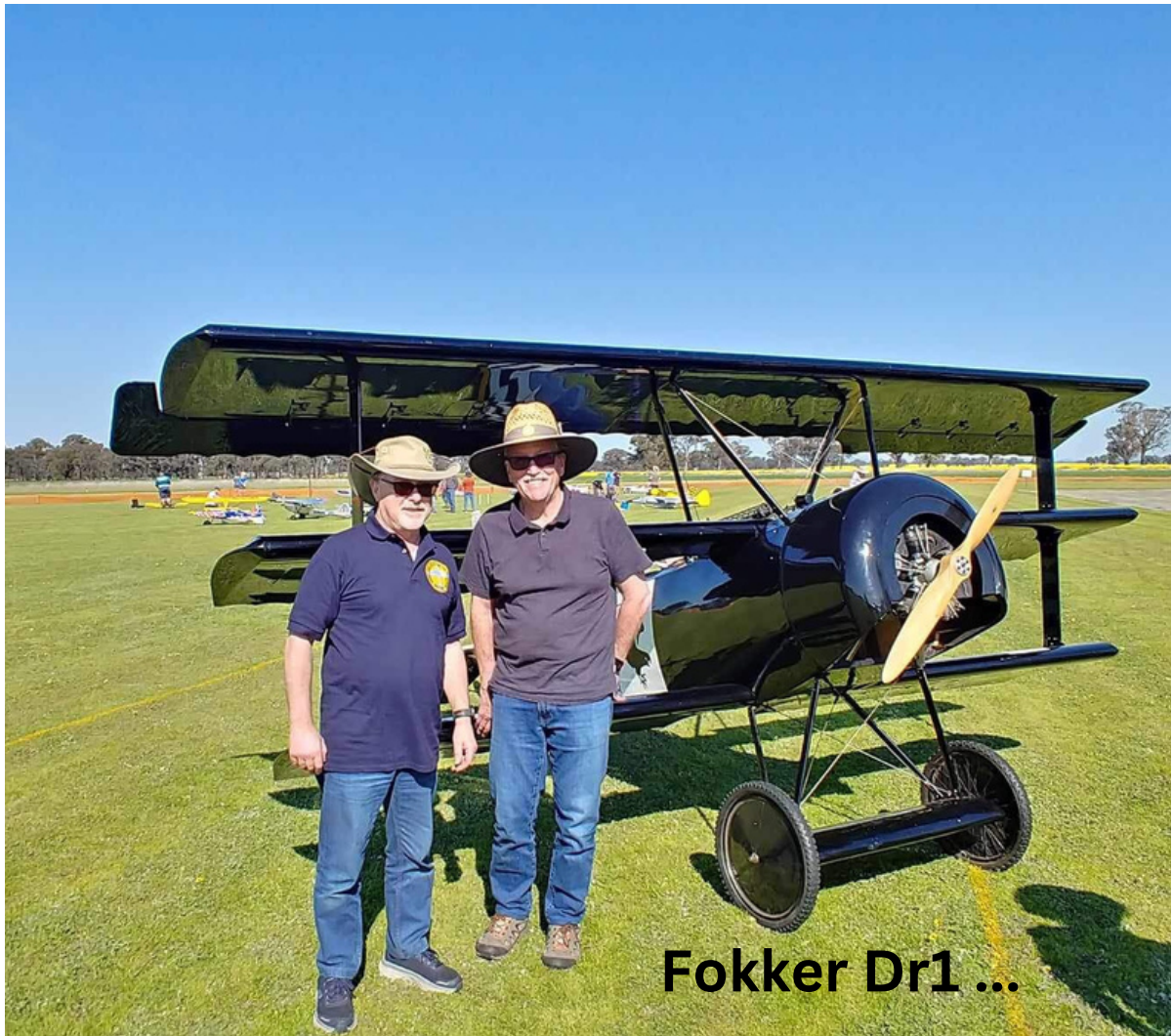
Fokker Dr1 ...